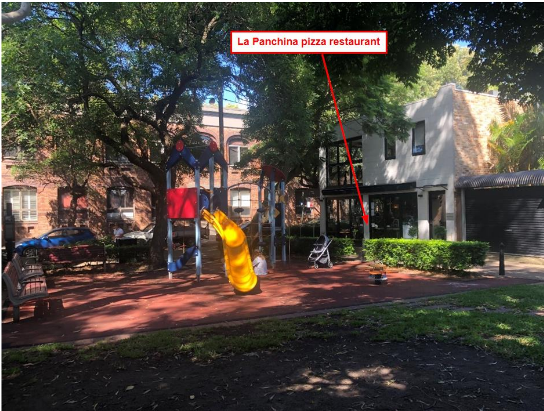
Existing playground in the reserve looking south towards Arthur Street – play equipment is at the end of its lifecycle; soft-fall is worn and separating from edges. Playground is well shaded from the existing trees. Small area of turf in poor condition.