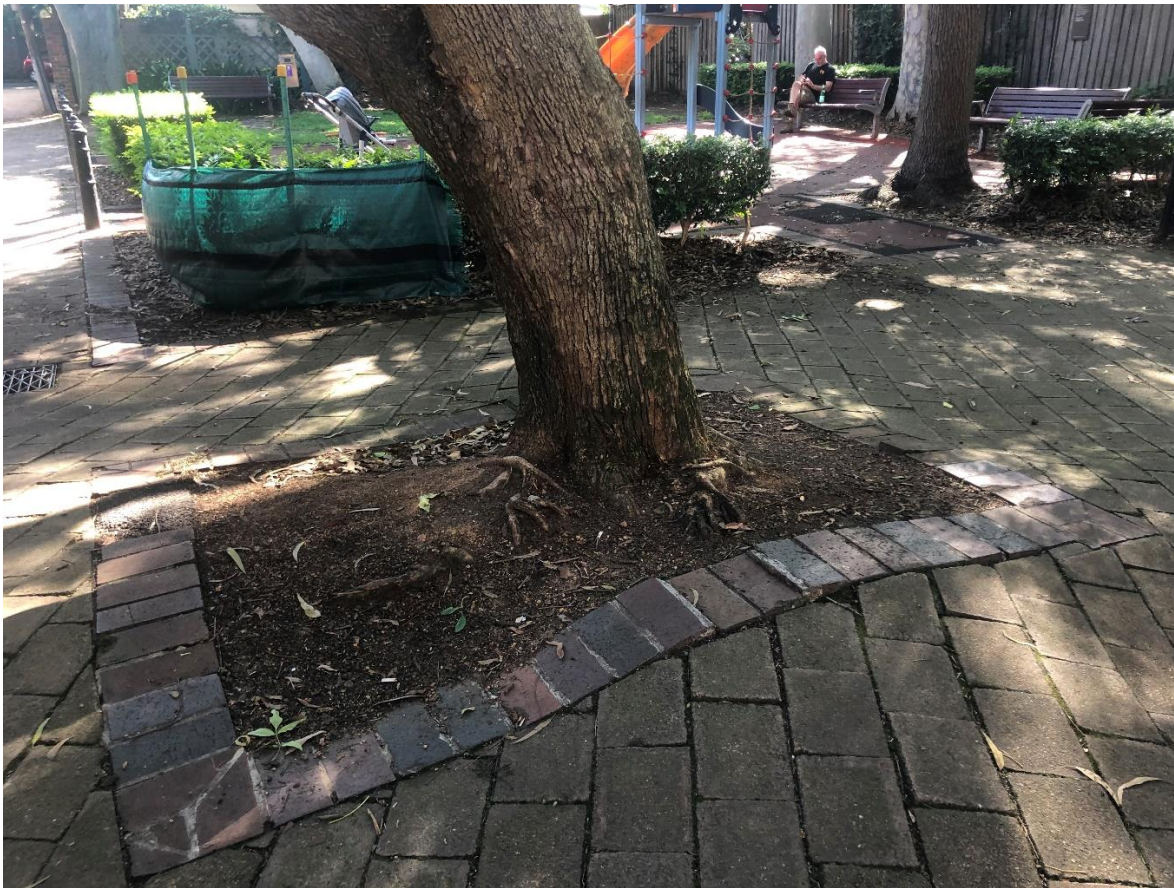
Uneven paving around street tree due to tree roots