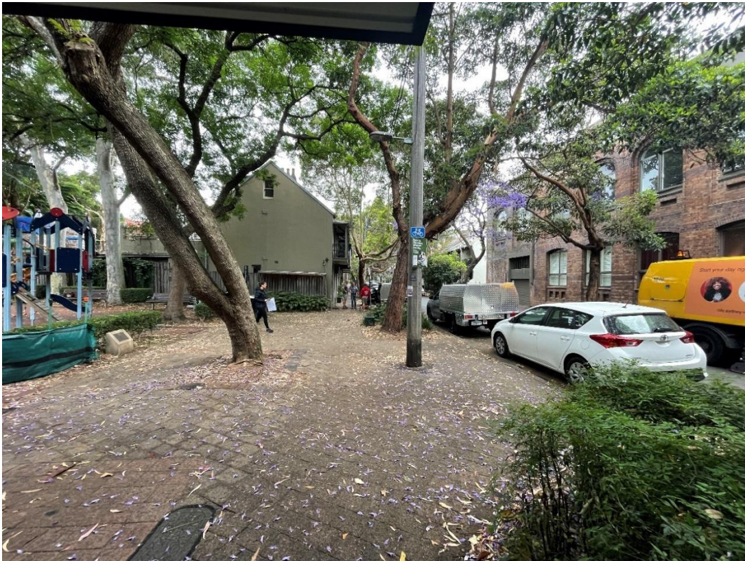
Looking south-east along Arthur Street – playground current location in the centre of the reserve. Uneven paving along the footpath.