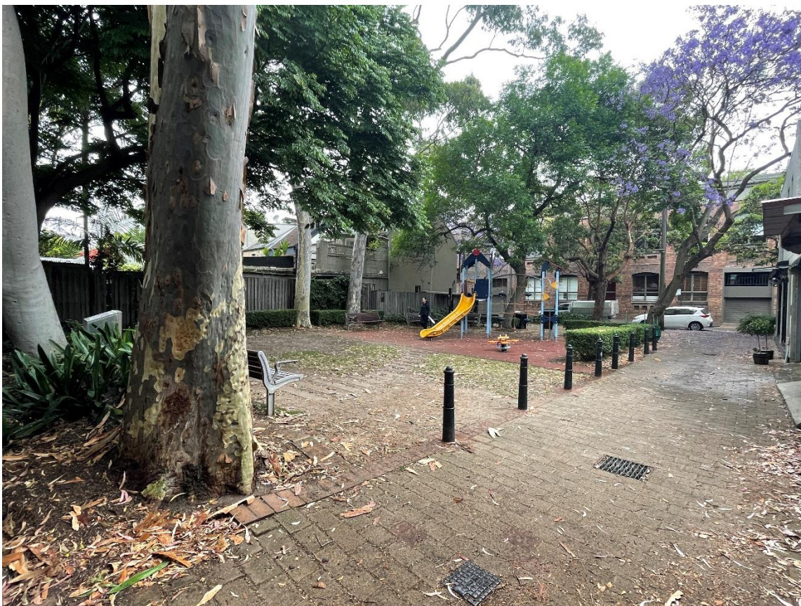
Looking south from Phelps Lane. Playground located in the centre of the reserve. Poor area of turf adjacent seating area to the rear of the reserve.